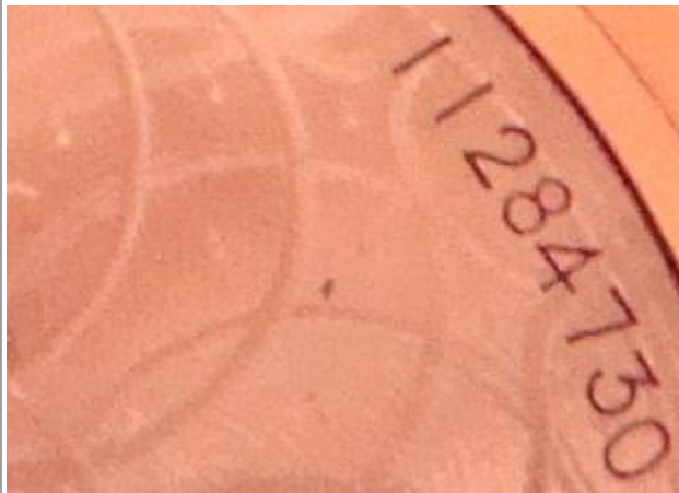
primary serial number

For larger scale images please see Figure 1 and 2 in the Appendix to this report.