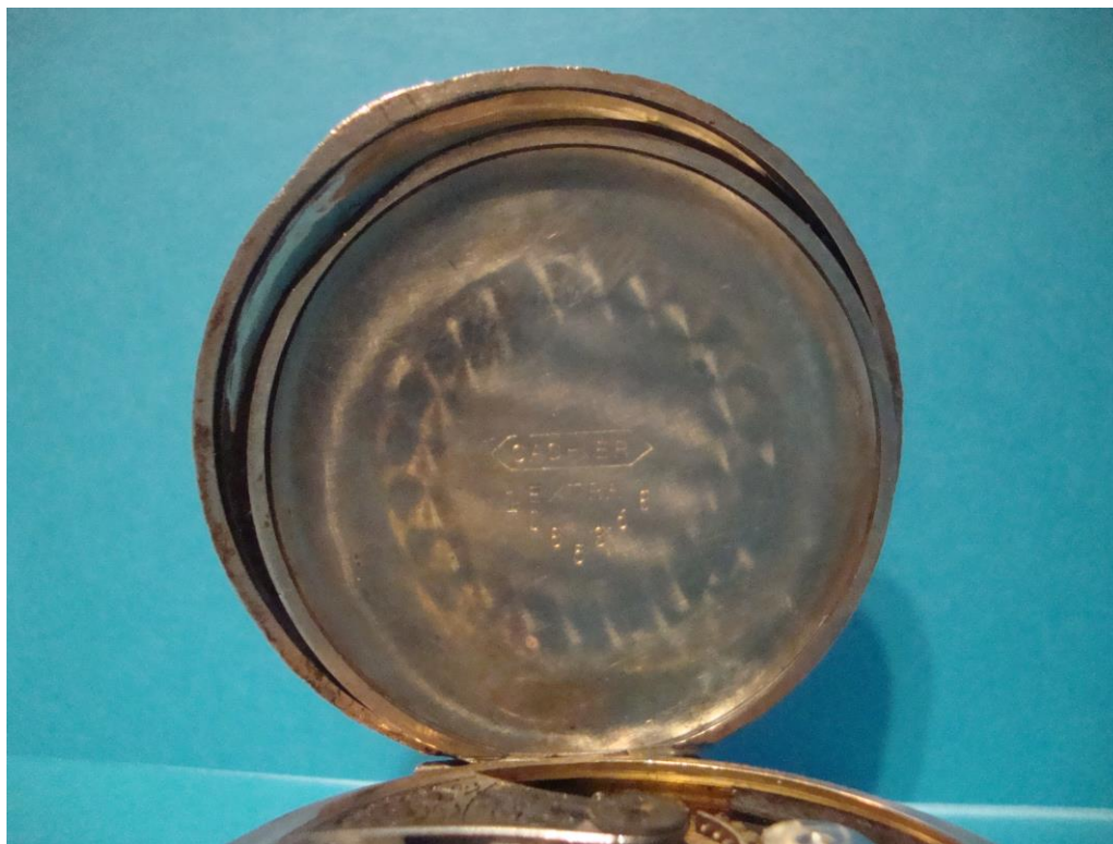
Figure 3: Baverstock Watch Inside Cover