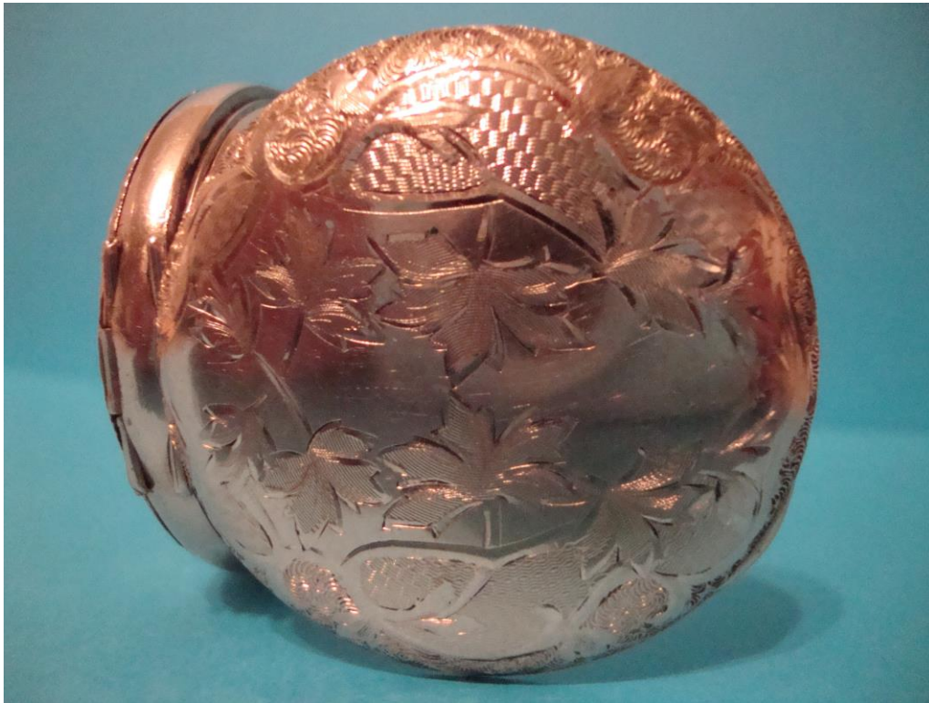
Figure 5: Baverstock Maple Leaf Case