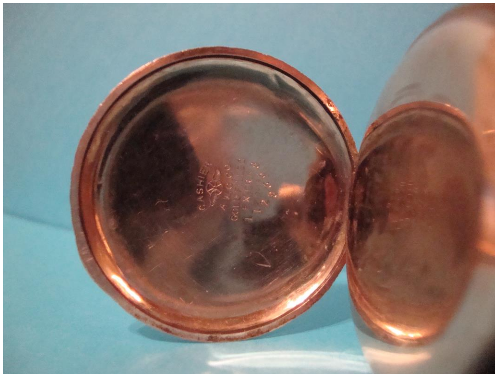
Figure 4: Baverstock Watch Inside Cover