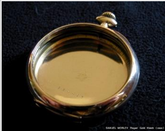
SAMUEL MORLEY "Regal" Gold Watch (case)