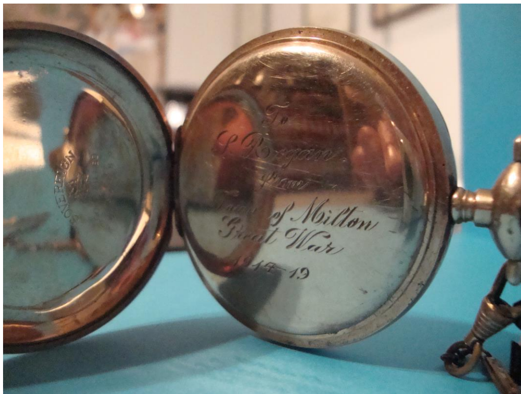
Figure 9: Regan Watch Inscription