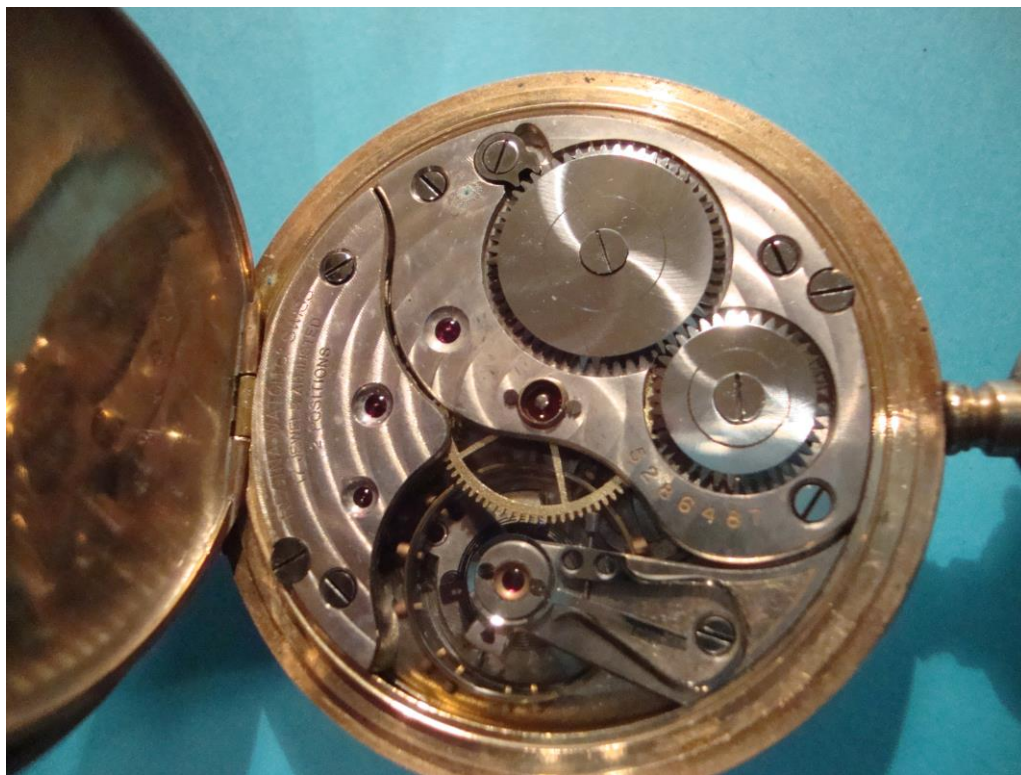
Figure 7: Regan Watch Number