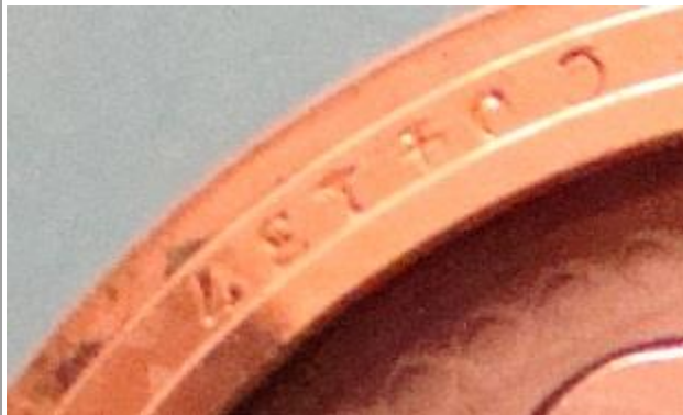
alternate number on rim