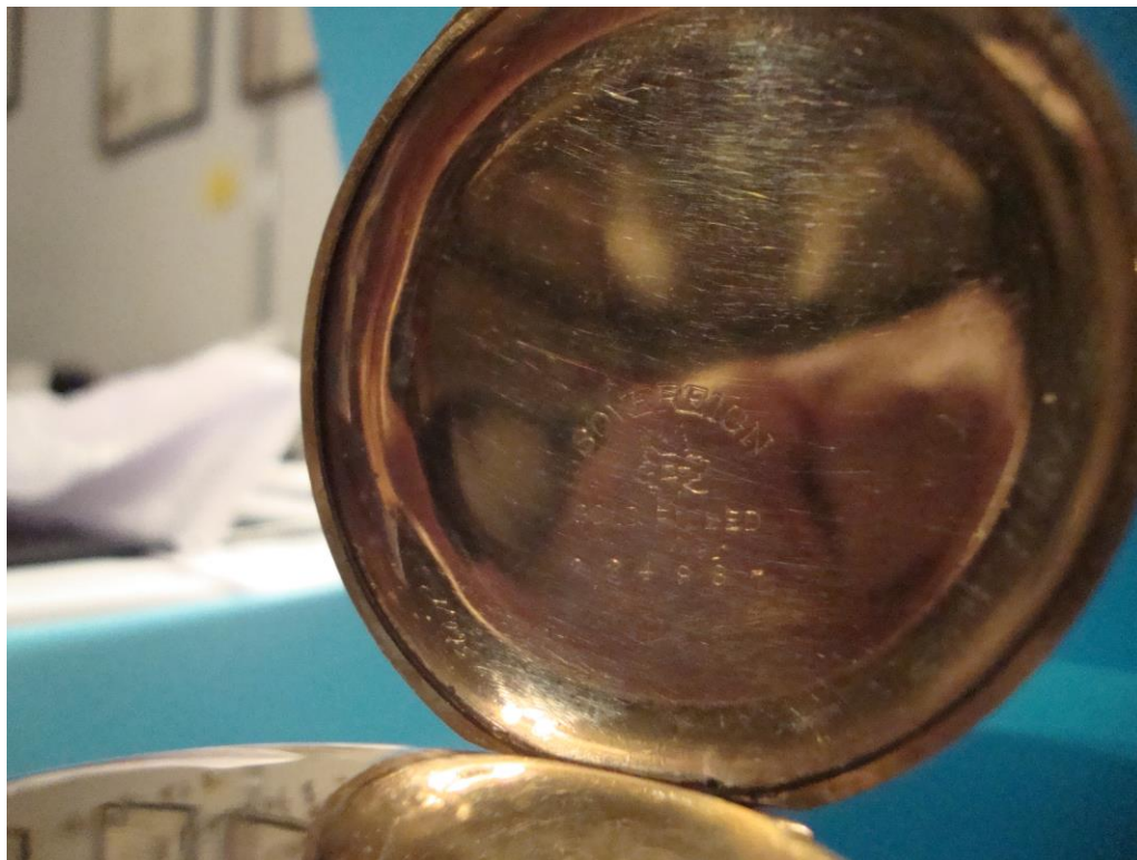
Figure 8: Regan Watch Markings