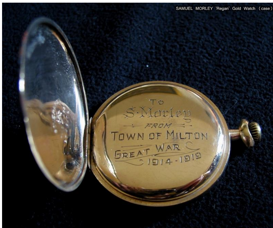
Figure 10: The Morley Watch