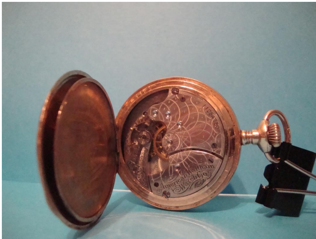
Figure 2: Baverstock Watch