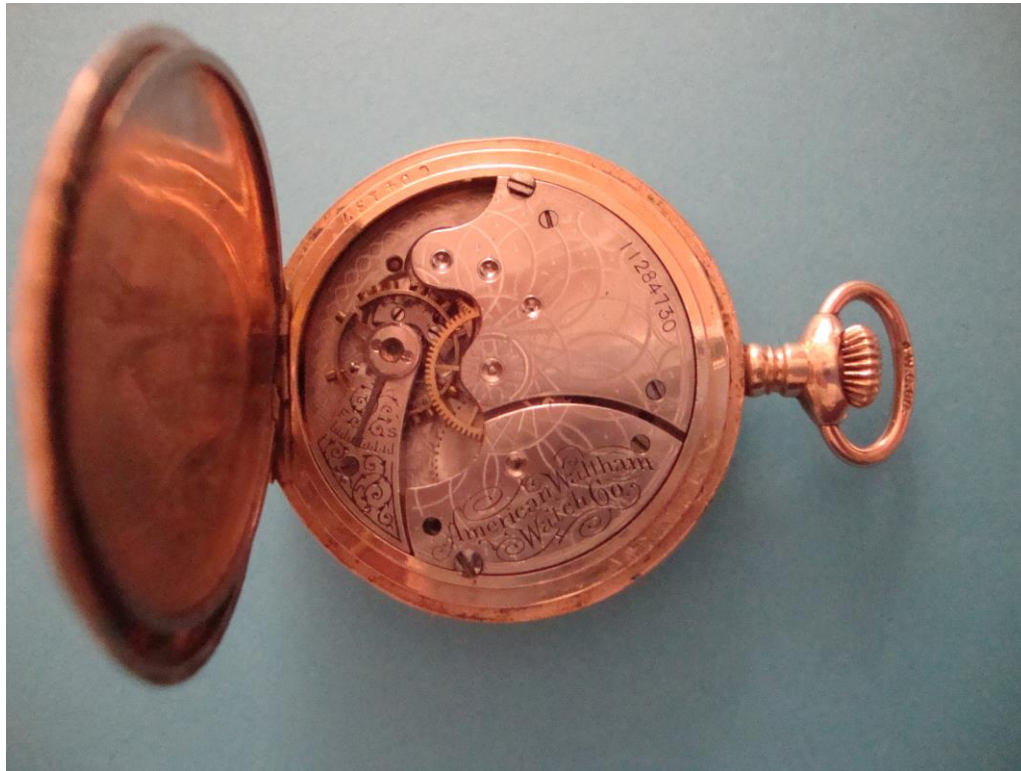
Figure 1: Baverstock Watch