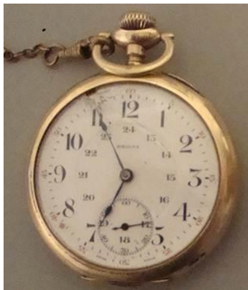
The Regan Watch