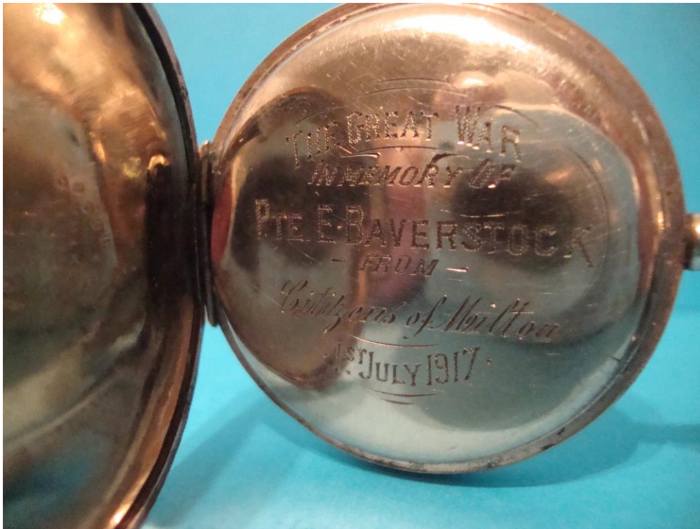
Figure 6: Baverstock Inscription